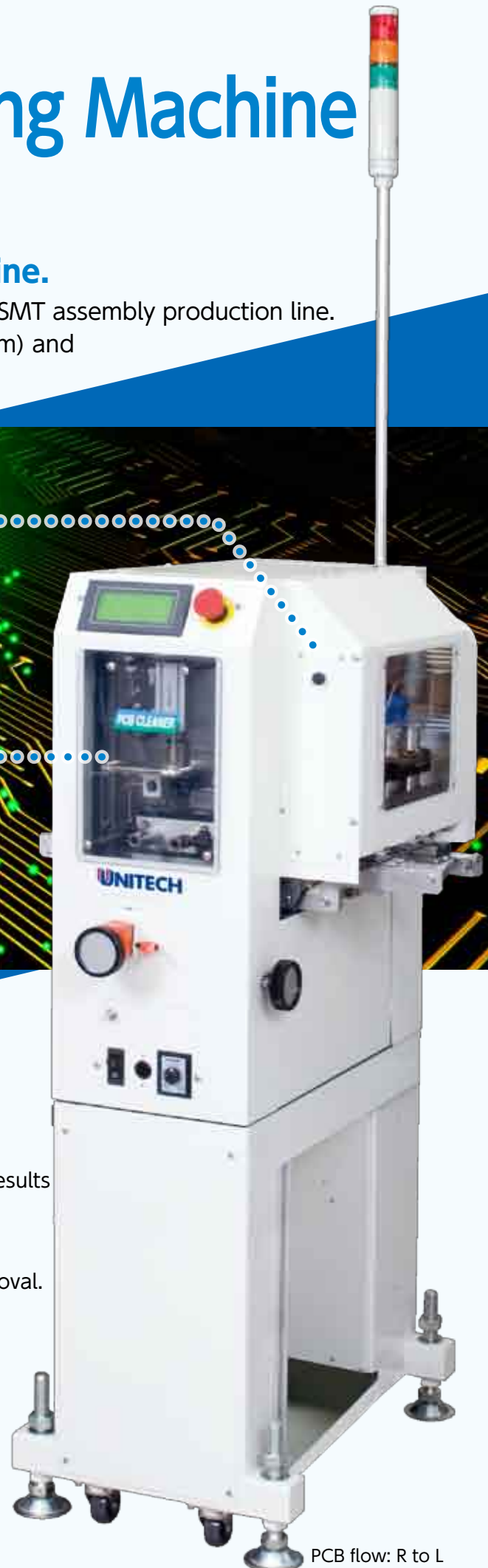
PCB flow: R to L

Brush ON + Rubber Rollers ON Both mode ON Brush ON + Rubber Rollers OFF Only Brush mode Brush OFF + Rubber Rollers ON Only Rubber rollers mode Brush OFF + Rubber Rollers OFF Pass mode